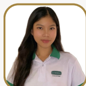
Cherry Ballesteros (Photo Journalist)