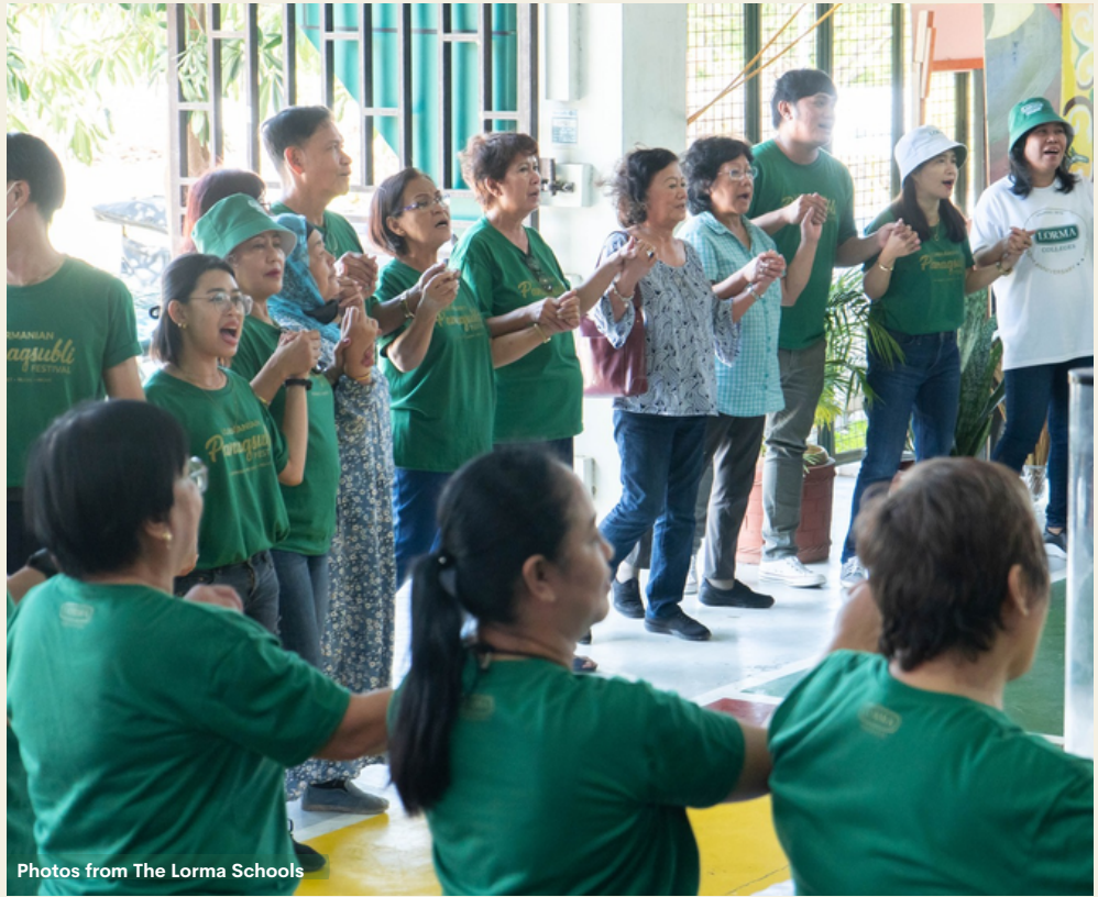
Photos from The Lorma Schools