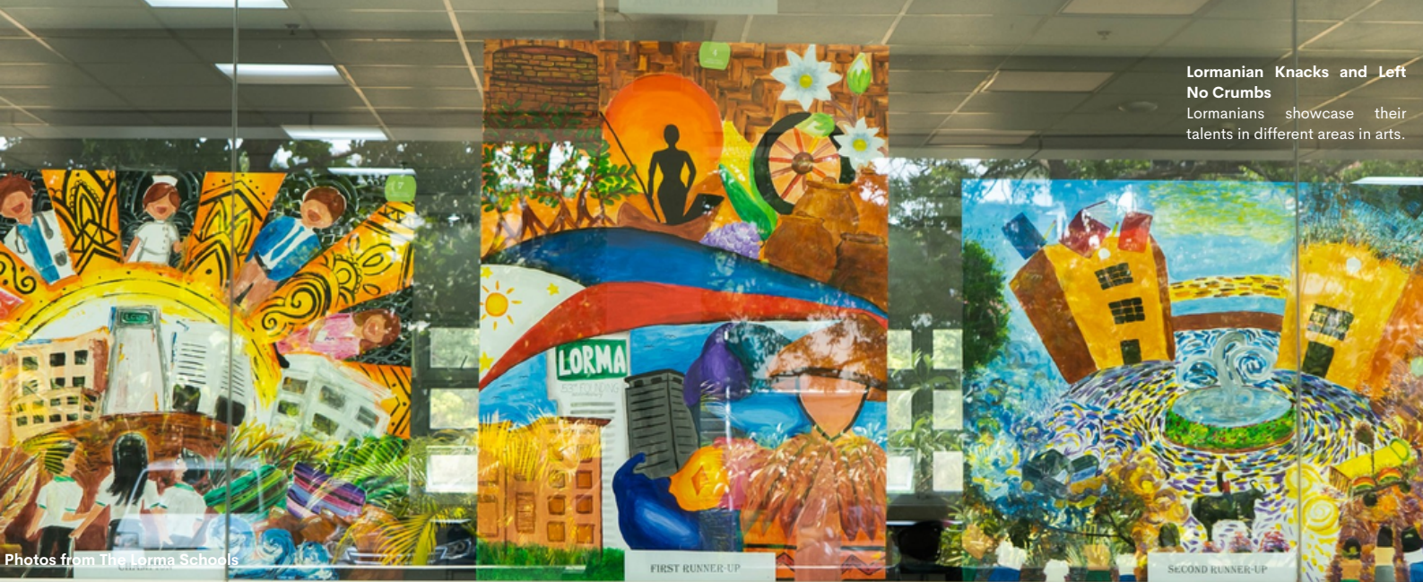
Photos from The Lorma Schools