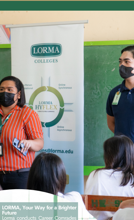
LORMA, Your Way for a Brighter Future Lorma conducts Career Comrades Caravan in various schools in La Union and provides overview of the courses offered in the institution.

The said caravan ended triumphantly hoping that the initiative of the college will help the students of the said schools to decide which program fits them well.