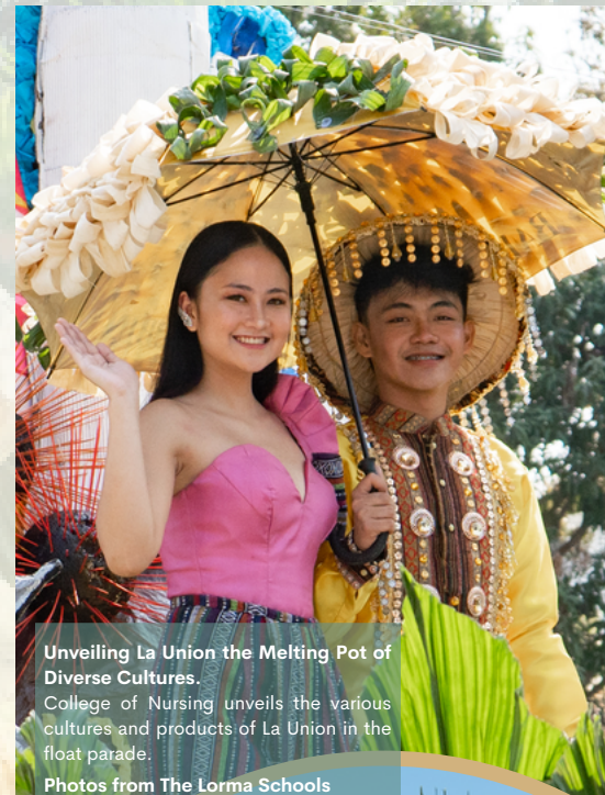
Unveiling La Union the Melting Pot of Diverse Cultures.

College of Nursing unveils the various cultures and products of La Union in the float parade.