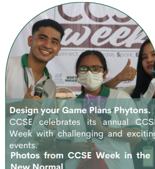
Design your Game Plans Pythons. CCSE celebrates its annual CCSE Week with challenging and exciting events. Photos from CCSE Week in the New Normal

CCSE Cares Outreach Program was conducted wherein the faculty members together with the College of Pharmacy visited Barangay Arosip, Bacnotan, LaUnion. The faculty conducted seminars and productivity tools for the residents.